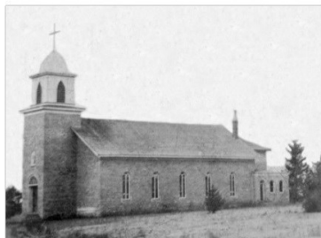
Immaculate Conception Church, Org. 1858