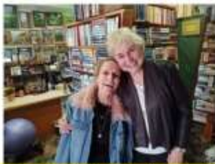
Paperback Plus Book Store No. St. Paul, MN October 5