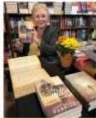
Once Upon a Crime Minneapolis, MN October 8