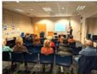
Oakdale Public Library Oakdale, MN October 24