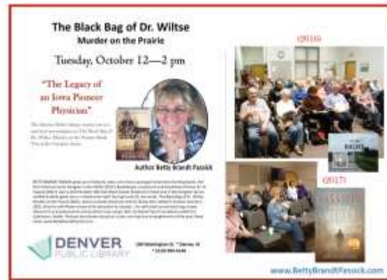
Book launch (hybrid) of The Black Bag of Dr. Wiltse, Murder on the prairie , at the Denver Public Library, Denver, Iowa, Oct. 12.

I reached for the latch, noticing a wide blotch the size of a man's palm. I sniffed for the indubitable metallic odeur of fresh blood. The streak ran along the frame to the floor; shards of discolored hay lay at my boots. Another flash of the lantern around the space revealed a long-handled wooden hatchet leaning against an exterior wall. Lift- ing it to the light, similar blotches emerged on the steel head, wood- en shoulder, and belly of the hatchet. This had been the tool of the crime. What violent thing had happened in this stable?