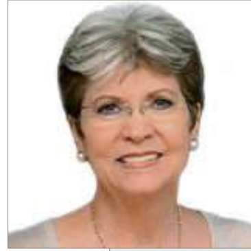
“Where Women Talk”