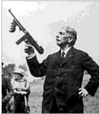
John T. Thompson and his famous Tommy submachine gun.