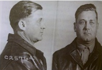
George "Bugs" Moran